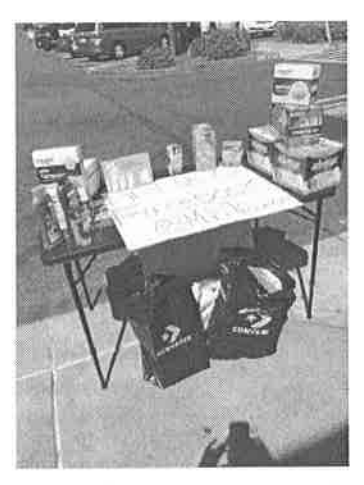
A local high schooler who goes by MJ is collecting hygiene and clothing items for peers in need.

Gardea and MJ collect the items at donation drives, or from individual community members who drop them off and then distribute to schools in the area. They've taken items to locations in Folsom, El Dorado Hills, Placerville and Pollock Pines, including El Dorado, Union Mine and Independence high schools.